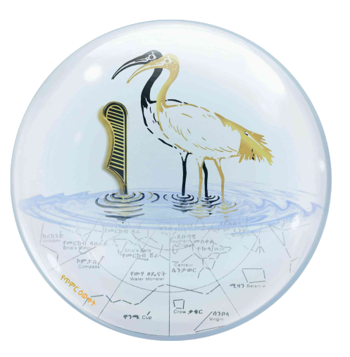
Black Open university

Join us here at the Black Open University in welcoming her here in her global research and outreach tour of presentations and seminars building Quality Assurance in education.